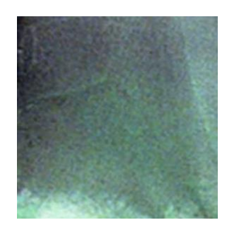
Verdi Green (VG)