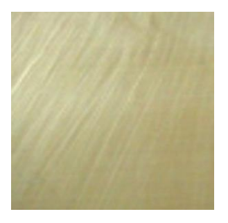
Raw Brass (RB)