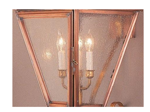
Seedy glass (S)