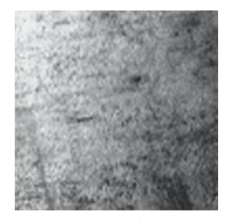
Ternplate (TP) *custom pricing needed*