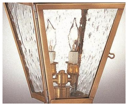
Spectrum Seedy glass (SS)