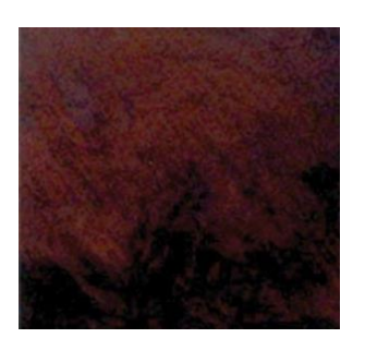
Dark Brass (DB)