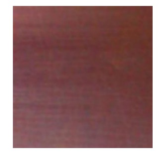
Unrubbed AC (URAC)