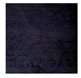
Dark Copper (DC)