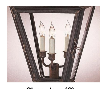
Clear glass (C)