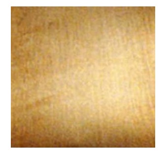
Antique Brass (AB)