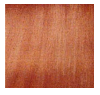
Antique Copper (AC)